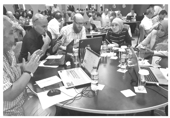
Group work in Istanbul, July 2018

Some very interesting issues have arisen around multilingualism. Arabic, Turkish, Kurdish, Russian, French and English are all used socially and academically by members of the cohort, and it has been fascinating, cognitively and culturally, to learn about how and when participants flip between languages, how they make meaning differently in these languages, how English academic discourse forces them into new ways of thinking about their work, and how their academic aspirations correspond to their uses of these languages.